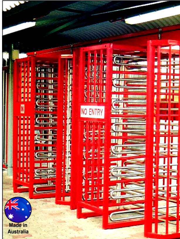
3 Arm Full Height Turnstile in Coca Cola corporate colours