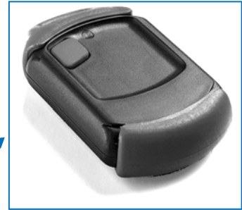
ST 1 Button Transmitter Part #100

The LK & GF logic controllers are suitable for use with 3 phase and single phase operators. They have facilities for loop detectors, PE beams, radio transmitters, timers and counters. Controllers can also be manufactured to customers specifications.