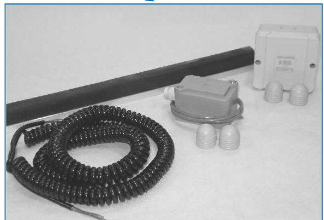
Pneumatic Safety Edge 3m Part # 89454 4m Part # 89455 5m Part # 89456