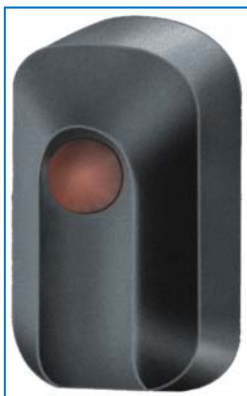
15 PE Beams Part #200