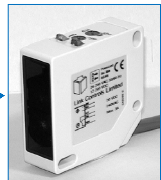
PC50 Reflective PE beam Part #8901