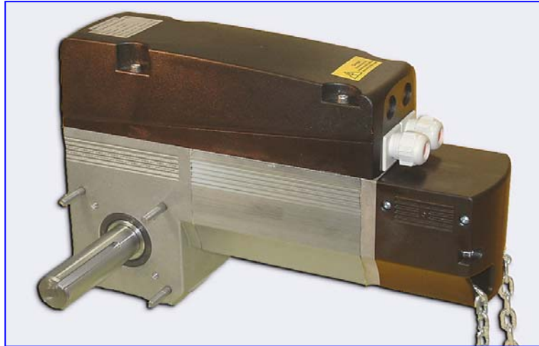
Operator shown with built on starter, stud mounting.

Roller Shutter Door Operator / Overhead Door Operator