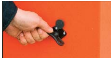
Easy to use external unlock device

Up to 10 pairs of FTM PE beams can be mounted on the same column without causing any interference.