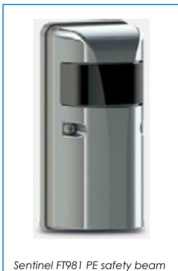
Sentinel FT981 PE safety beam

The lens can be moved through 90 degrees to accommodate misalignment and the casing is waterproof to IP55. The operating range outdoors is 8 metres.