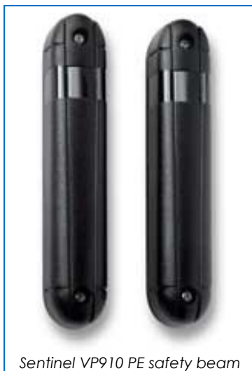
Sentinel VP910 PE safety beam

LED indicators aid with the alignment and an outdoor range of 15 metres means that it is suitable for most large gates and doors.