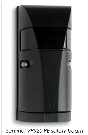
Sentinel VP920 PE safety beam