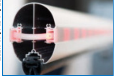
The strong elliptical pole section and center rib, ensure stability in high winds. LED flashing lights are an option.