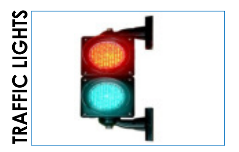
LED TRAFFIC LIGHTS: There are two sizes available 100 mm and 200 mm diameter. For access control situations red / green is normally preferred but red / green/ amber are also available.

RFID CARD ACCESS CONTROL: The M1000 controller is a basic system designed to operate two boom gates. It is a stand alone system and can easily be programed to void cards using the LCD display on the unit.