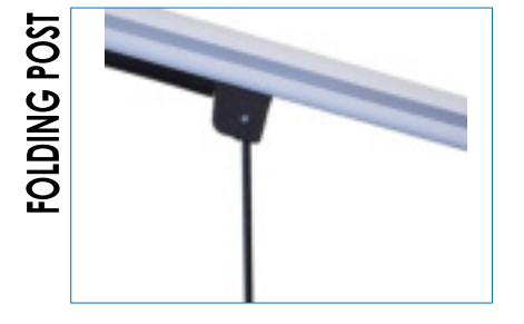
FOLDING SUPPORT POST: This support post is mounted on the boom pole and has a height adjustable leg. That maintains the pole in a horizontal position.

FOOT MOUNTED ADJUSTABLE SUPPORT POST: This sturdy post supports the boom pole and the height is adjustable on site to allow for kerbs or uneven roadways.