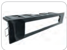
HA-130 Internal mounting bracket