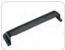
WC_IR/BL Black weather cover