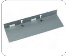
UTB Under Mount Bracket