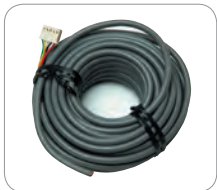
5 PIN CAB-8m Hotron 8M cable